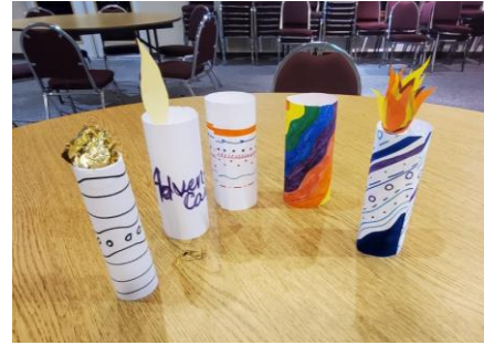
Candle examples by the Confirmation class.

For more ideas: https://ministryspark.com/10-simple-advent-wreath-ideas/