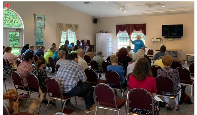
The August 18th Blessing of the Pets Service held inside due to threatening weather!