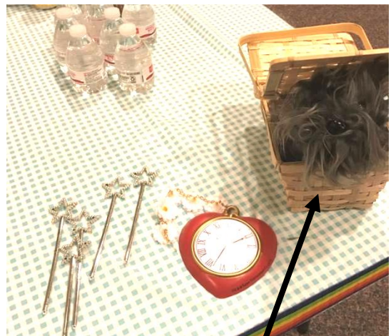
Toto came too!

Please contact Pastor Nansi if you are able to attend.