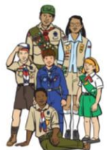
Scout Sunday Feb. 4